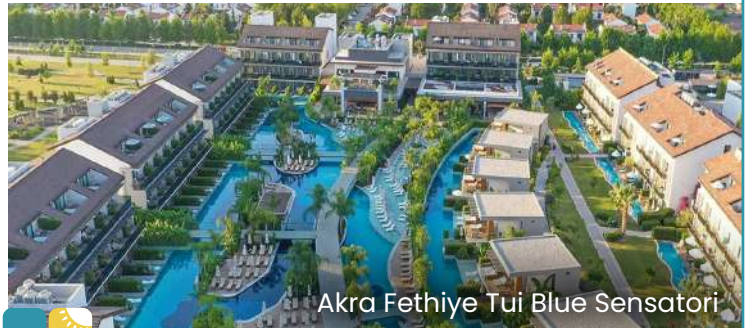
Akra Fethiye Tui Blue Sensatori