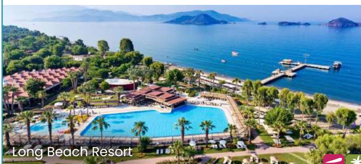
Long Beach Resort